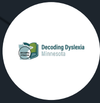
Decoding Dyslexia Minnesota