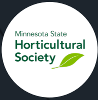
Minnesota State Horticultural Society