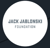
Jack Jablonski Foundation