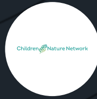
Children & Nature Network