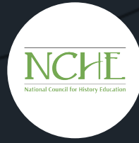
National Council for History Education